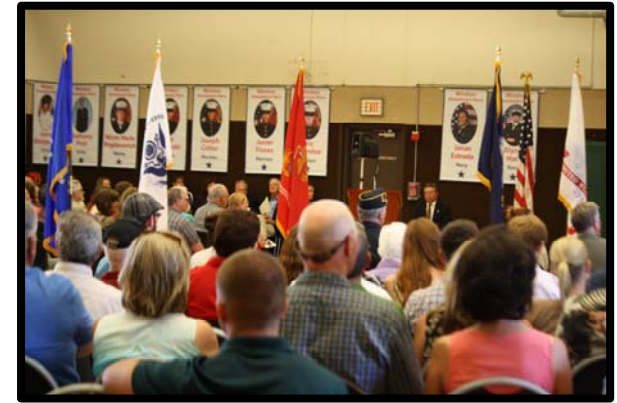
Hometown Heroes Military Banner Ceremony

Having an immediate family member working or residing in Windsor area (spouse, parent, grandparent, brother, sister, son, daughter, aunt or uncle).