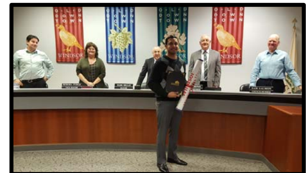
Hometown Heroes Military Banner Retirement